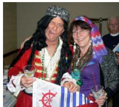
The Valpeys showed up in fine Pirate regalia, befitting to their personalities!