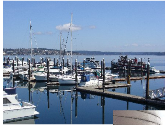
Sunday, Port Orchard marina