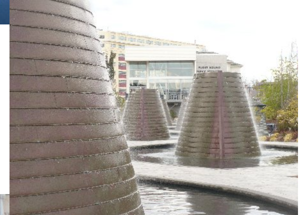
Bremerton park by Museum and Ferry Terminal