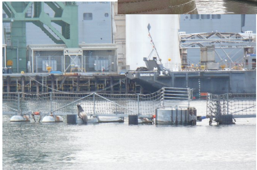
Spot the Navy Seal?